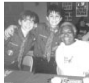
Cub Scouts from St. Mary's 4th Grade, Den #5, Pack #101 playing BINGO with senior residents of 155 East Shore Road on February 2, 2006.

Spring Bereavement session for widows and widowers to be determined. More information will follow in the Sunday bulletin.