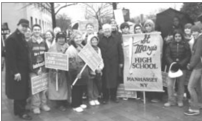
St. Mary's group at Right to Life March on January 23, 2006.