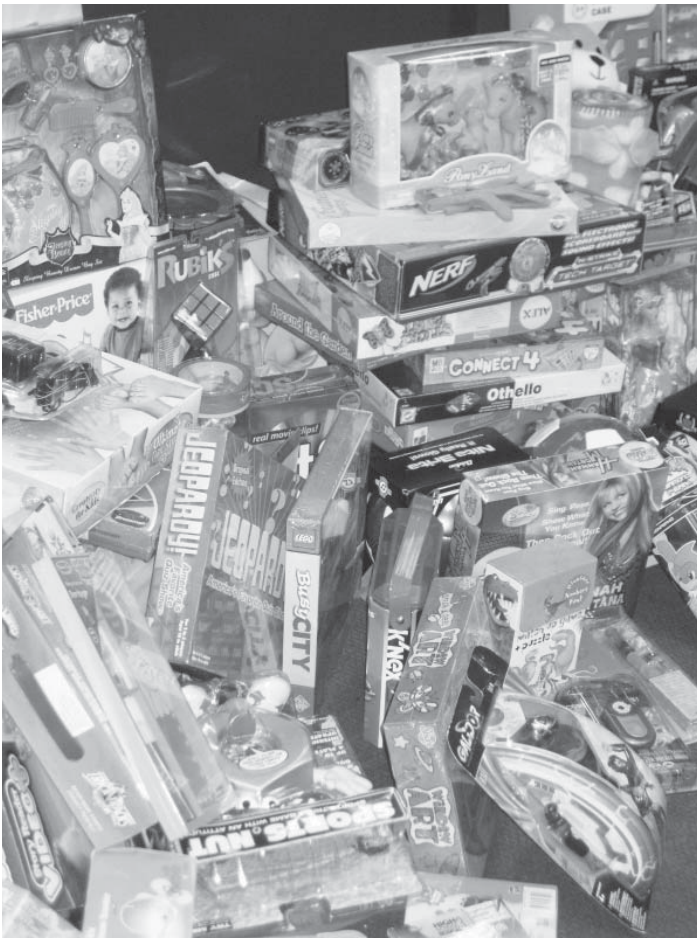
Gifts lined the foyer of the Elementary School's Northern Boulevard entrance.

Once again, Saint Mary's Elementary School continued their long-standing tradition of reaching out to underprivileged children in local communities through the St. Vincent DePaul Society Toy Drive. The students benefit immeasurably by taking a moment to remember the true meaning of Christmas and Christ's devotion to people in need, especially when those people are helpless children. Hundreds of toys, games, sports equipment and more were donated by the entire school. The Student Council proudly collected and organized the gifts that were picked up on December 16th by St. Vincent de Paul.